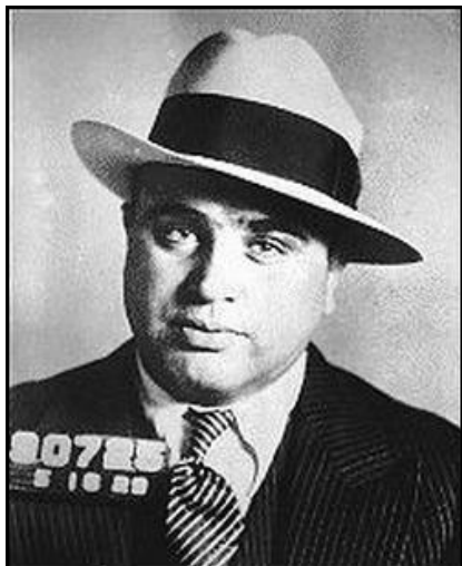
Not known to have been an Irish Banker: Chicago Gangster Alfonse Capone

Before emigrating to America an esteemed mentor of this writer advised him to do as he pleases—murder, pillage, desecrate, instigate a revolution, start up a Fianna Fail cumann— but above all else pay his taxes. Upon enquiry from the writer as to why paying taxes was an absolute necessity, the s-