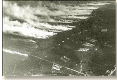
French gas attack on German lines Belgium, 1916

most capricious - a change in wind direction could spell disaster. Initially, gas cylinders were simply placed along the front lines facing the enemy trenches. Once the wind was deemed favorable, the cylinders were opened and the gas floated with the breeze, carrying death to the enemy. Later, gas was packed into artillery shells and delivered behind enemy lines. No matter the method of delivery, its impact could produce hell on earth. Chlorine and phosgene gases attacked the lungs ripping the very breath out of its victims. Mustard gas was worse. At least a respirator provided some defense against the chlorine and phosgene gases. Mustard gas attacked the skin - moist skin such as the eyes, armpits, and groin. It burned its way into its victim leaving searing blisters and unimaginable pain.