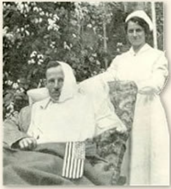
The author recovering from wounds received at the Front

They told me that I had been 'out' for three hours; they thought I was dead.