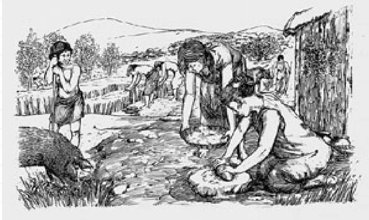
An artist's impression of the first farmers