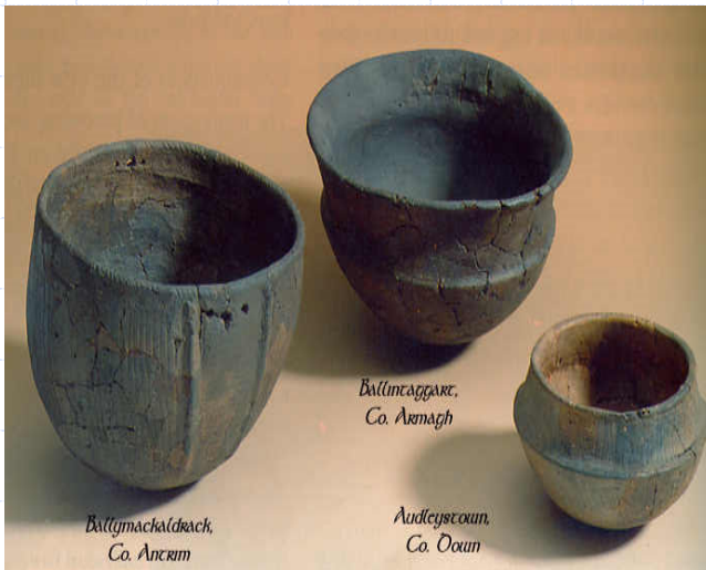
Pottery - containers