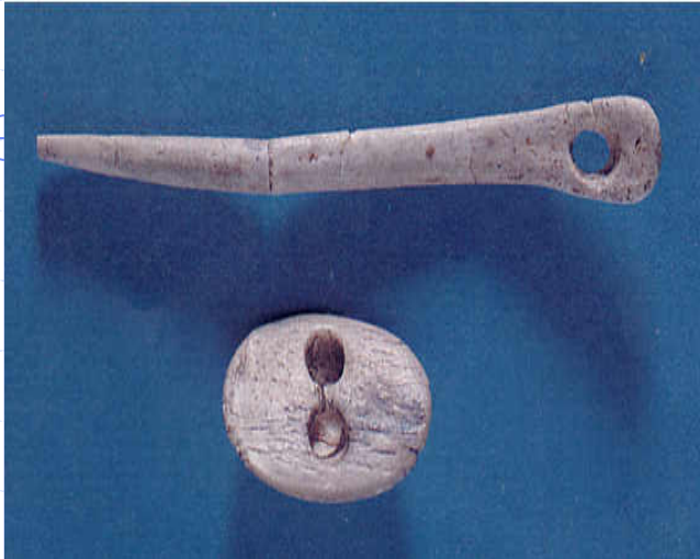
Household Goods – needle and button