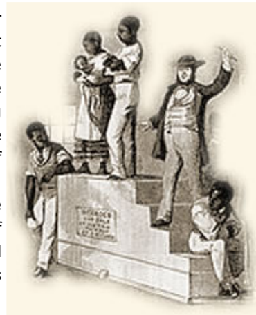
On the Block From a Contemporary Illustration