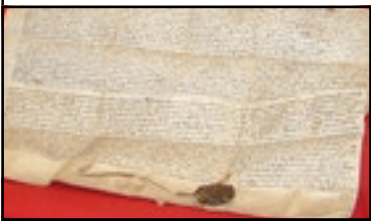
Original 1613 Royal Charter

I will include some material about Gerald's text on www.traleetimes.com as soon as it becomes available to me.